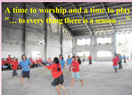
A time to worship and a time to play "... to every thing there is a season ..."

We thank the Lord for what He is making available to help us reach our youth and children through the support of our PARTNERS and many of our churches in the USA!