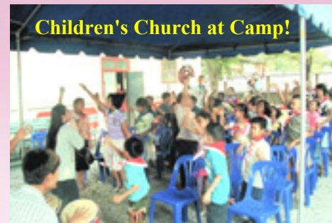
Children's Church at Camp!