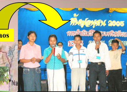
5 Laotian Youth at Youth Camp