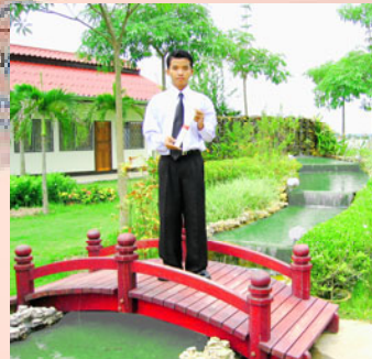
New Two-Year Graduate