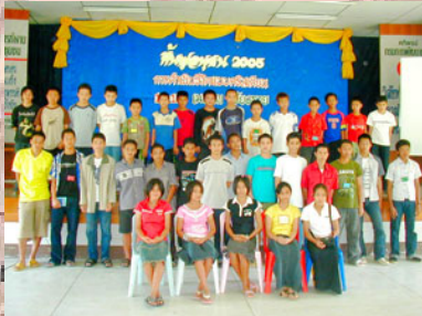
34 Baptized at Youth Camp