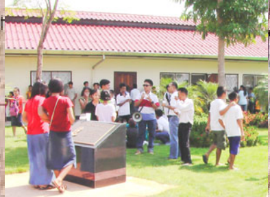
Youth Camp Visits Bible School