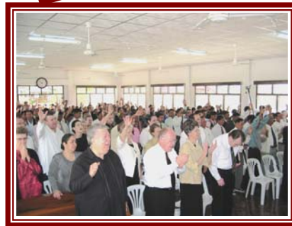
Heart-felt worship by some of the 220 attendees at the morning-long dedication.