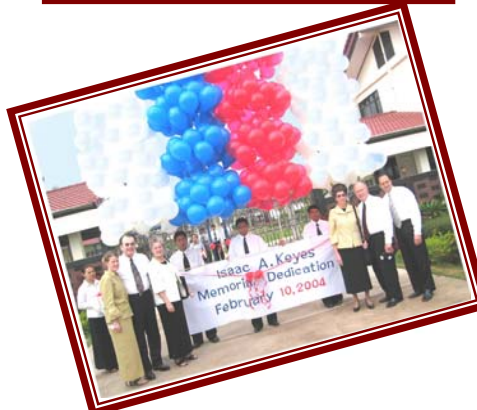
The Keyes family at "balloon lift-off" of the dedication banner.