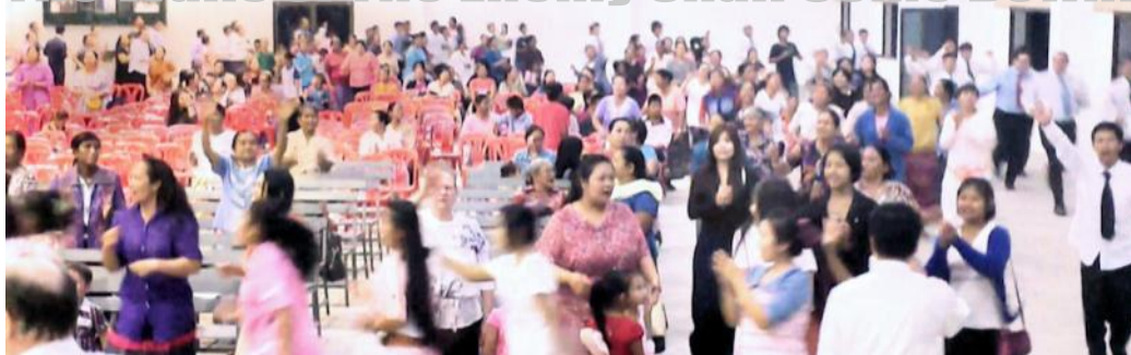
ABOVE: The Holy Ghost came down in power and everyone ran to the music "Walls of Jericho"