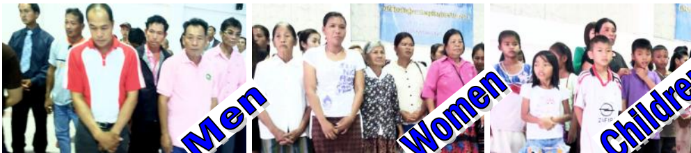
109 men, women and children gave witness that they received the Holy Ghost in the conference.